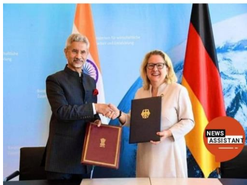
EAM S Jaishankar meets German Minister for Economic Cooperation and Development Svenja Schulze