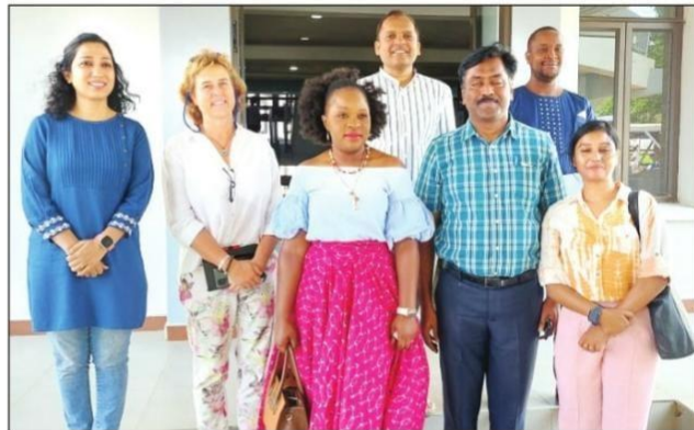
PARTNERS IN DEVELOPMENT—Labour Minister Vera Kamtukule (third, first row) and members of the GIZ and India government team

Gummert said the business incubators, will help women develop start-ups with latest technologies which can redefine supply chain systems, support value addition and help innovate food products so that they can meet the demands of new-age consumers.