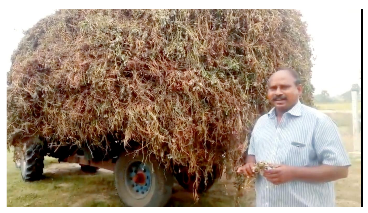
SHEEP FARM(DURING CONSTRUCTION)