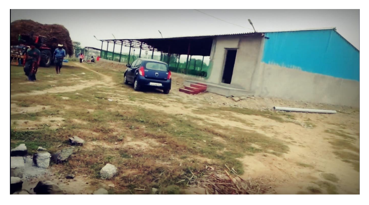
INTENSIVE TYPE OF RAM LAMB REARING