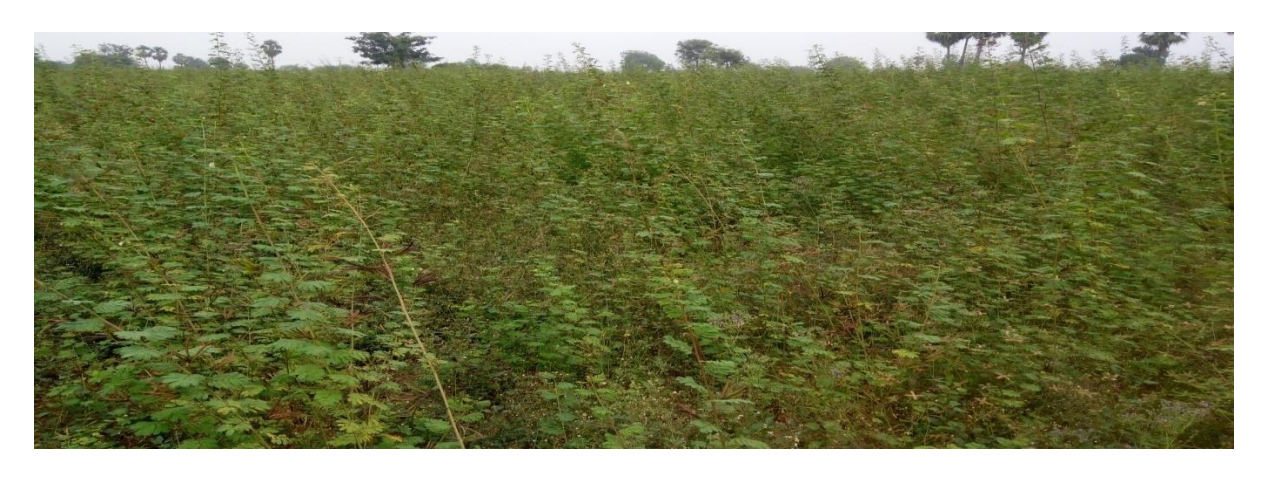
GROUND NUT STOVER(Dry Fodder)