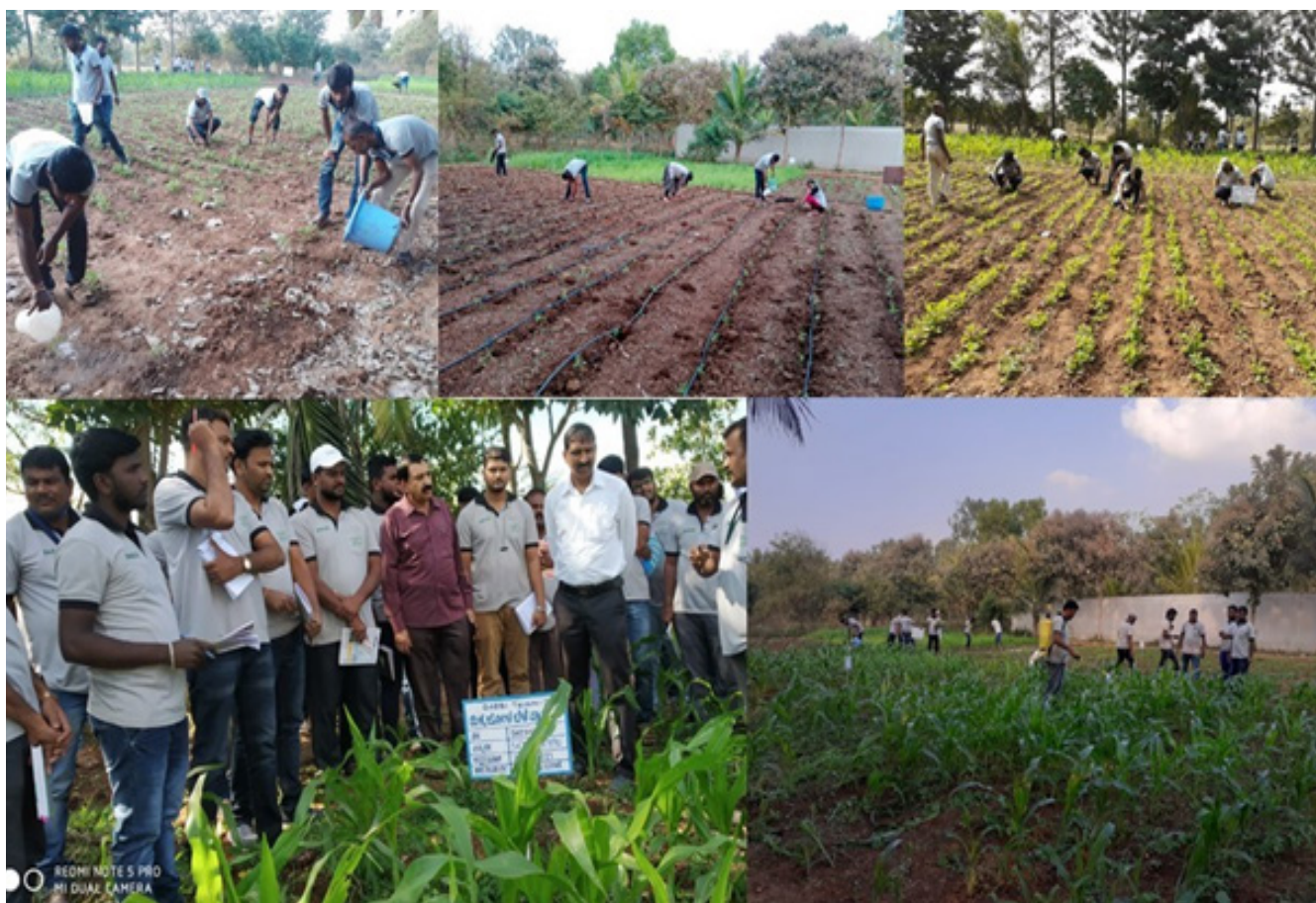
Candidates carrying different farming practices during their experiential learning

The crops that were grown on the experiential learning plots were groundnut, maize, marigold and fodder crops. The student groups are taught to adopt the important concepts of modern agriculture like INM, IPM, IDM and IWM with enriching their knowledge through the practical implication of each technology and later it will make them to become perfect para-extension worker after completion of the course. At final stage the students are expected to learn the cost economics i.e. assessment of productivity, production, cost of cultivation, return, cost benefit ratio and so on.