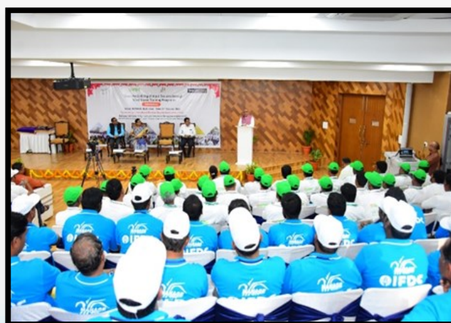
DG, MANAGE Addressing the participants