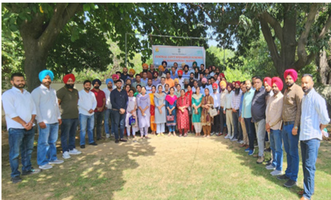
ATMA officials at the workshop at PAMETI

Punjab Agricultural Management & Extension Training Institute (PAMETI) organized a state-level workshop at PAMETI-Ludhiana. The workshop aimed to educate ATMA officials about the operational and financial guidelines to effectively implement various central government-sponsored schemes in Punjab