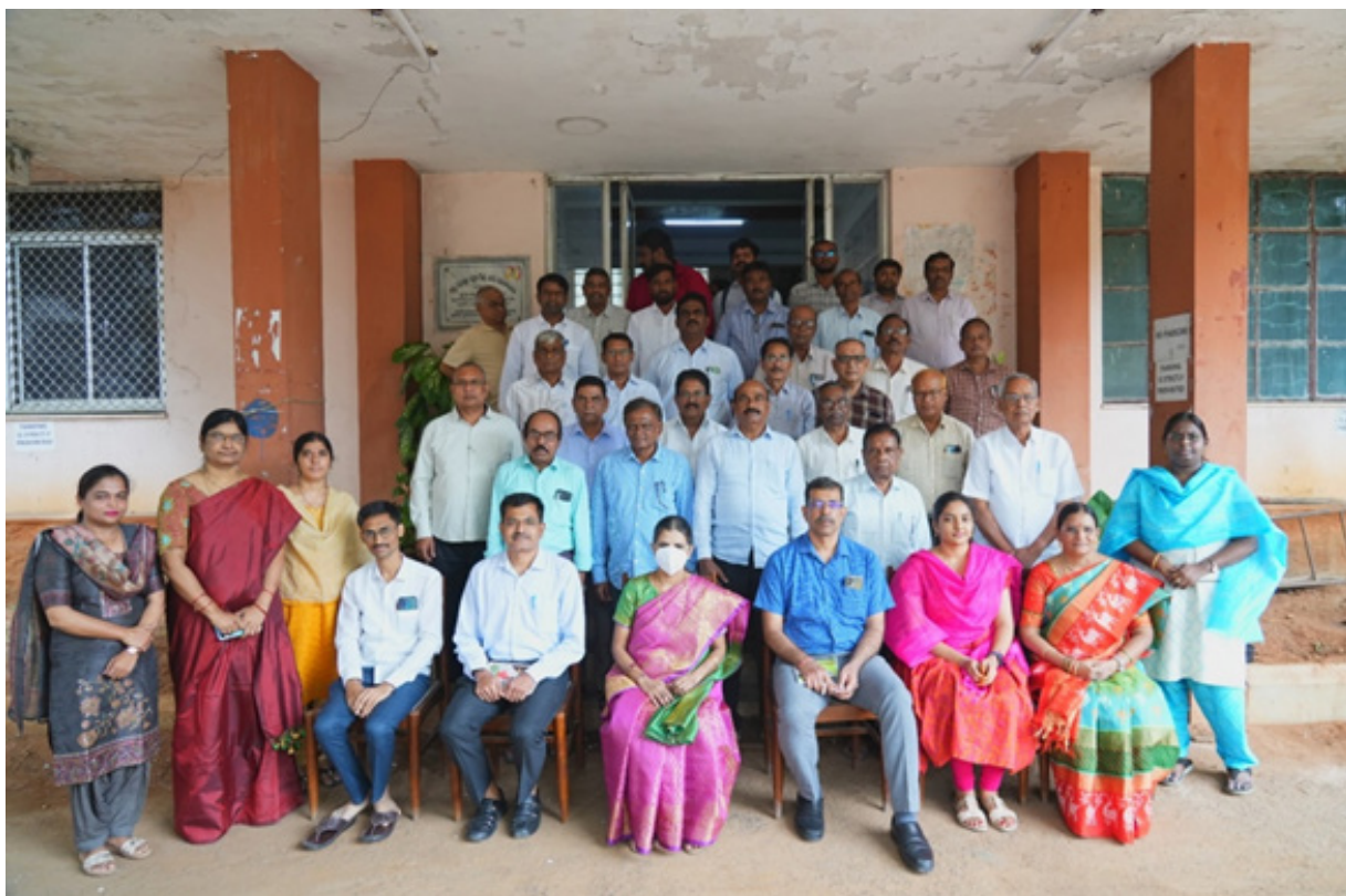
Participants of the workshop with the dignitaries