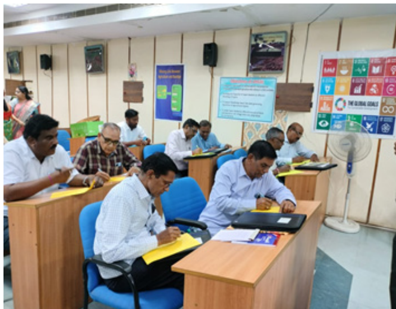
Facilitators engaged in session activities

In the valedictory programme, feedback and suggestions were taken by the participants and they requested SAMETI to supply study material in local language, recognition of facilitators for their outstanding work in implementation of DAESI, number of sessions to be increased per resource person and the shortage of resource persons in the remote areas where DAESI is being implemented. Dr. Mahantesh Shirur (Principal Coordinator- DAESI) appreciated the