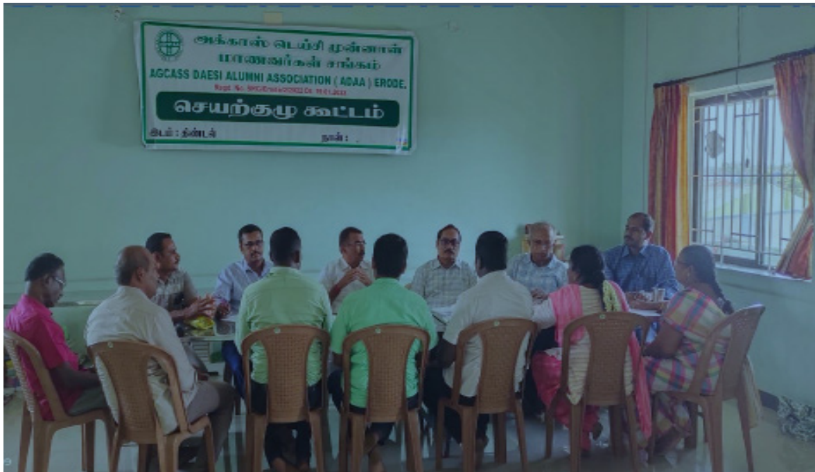
ADDA Executive Council meeting in progress

pest management. To meet the vegetable requirement of the households, roof top gardening is also promoted by the ADDA. The societies established like ADDA will definitely change the inputs delivery organization system and streamline the para-extension activities by the private players.