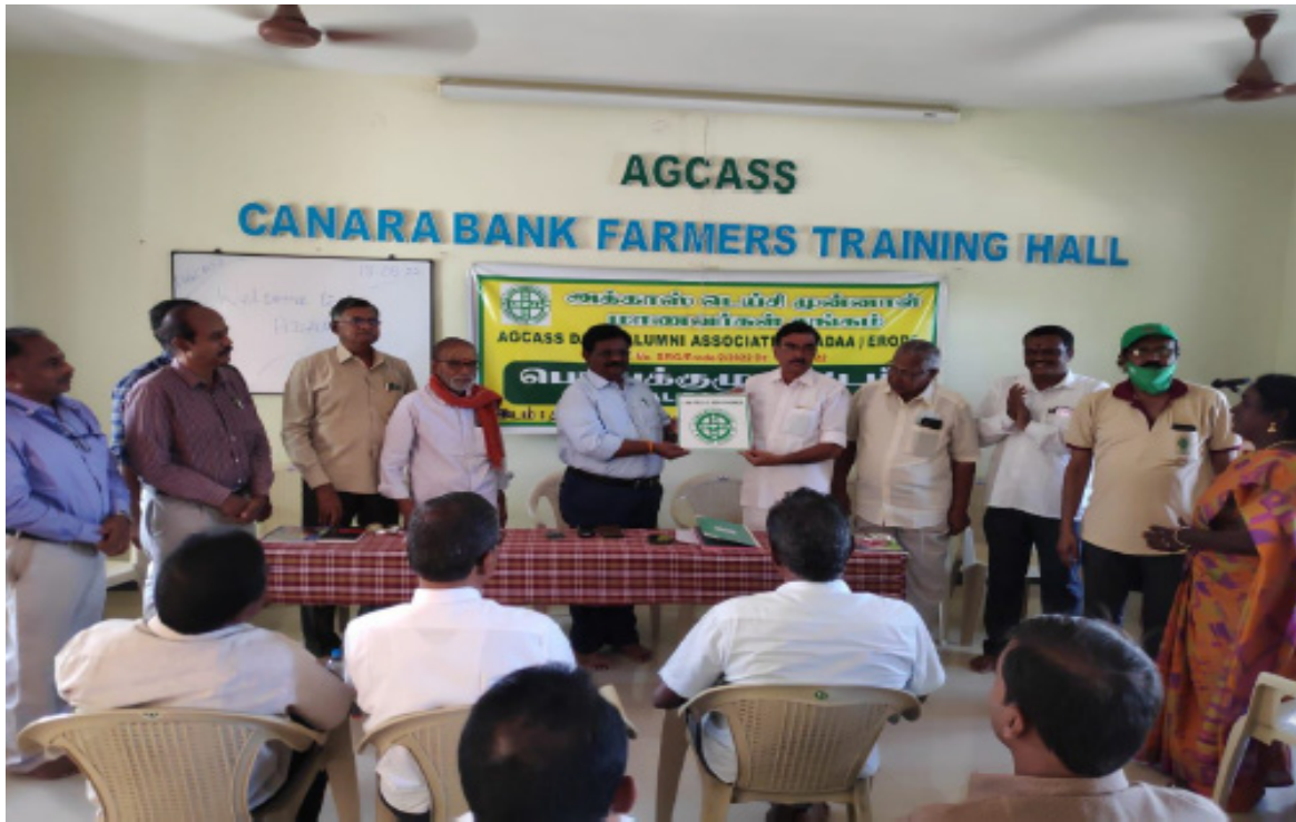
Release of ADDA logo by the members of the association

ADDA, in its third general body meeting, plans to go a step ahead by initiation of talks with the Agricultural department officials to address their problems. Further, they have decided to conduct village meetings frequently to demonstrate recent technologies such as drone spraying for integrated