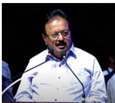
Sri N. Chaluvarayaswamy Agriculture Minister- Government of Karnataka