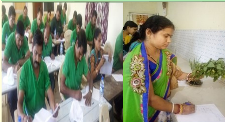
DAESI Final exam at ATMA, Balasore, Odisha