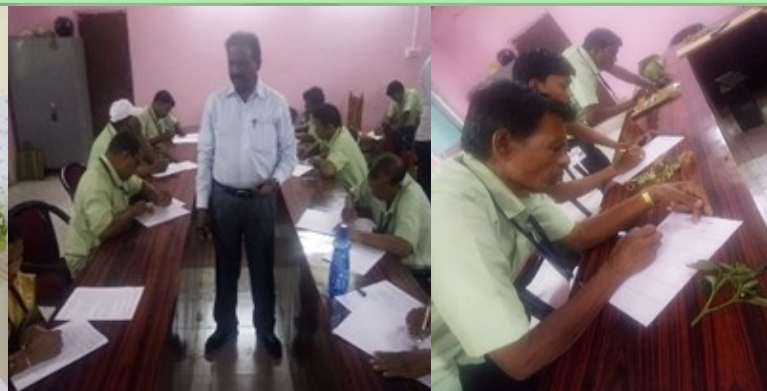
DAESI Final exam at ATMA, Bhadrak, Odisha