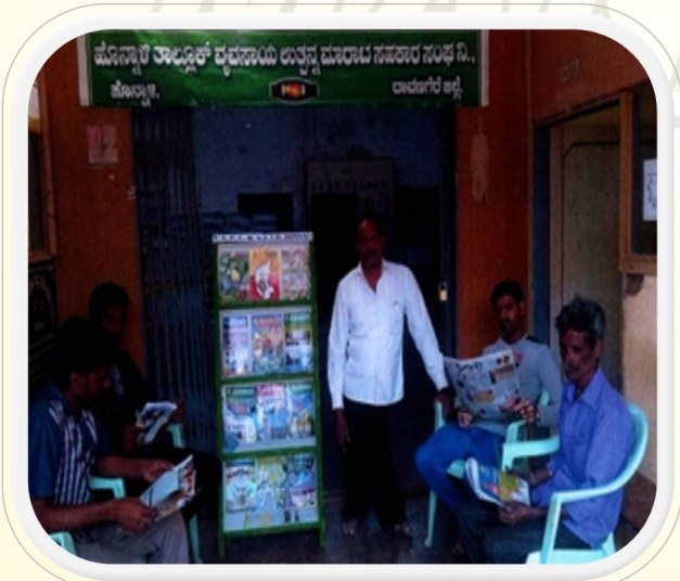
Extension corner established at TAPCMS, Honnali, Davanagere district, Karnataka.

MANAGE is making efforts to promote “Extension Corner” in the DAESI trained input dealer’s shop to transform input shops into Knowledge Centers. In response to MANAGE efforts many SAMETI’s and NTI’s are working seriously & motivating the trained input dealers to establish extension corners in their shops.