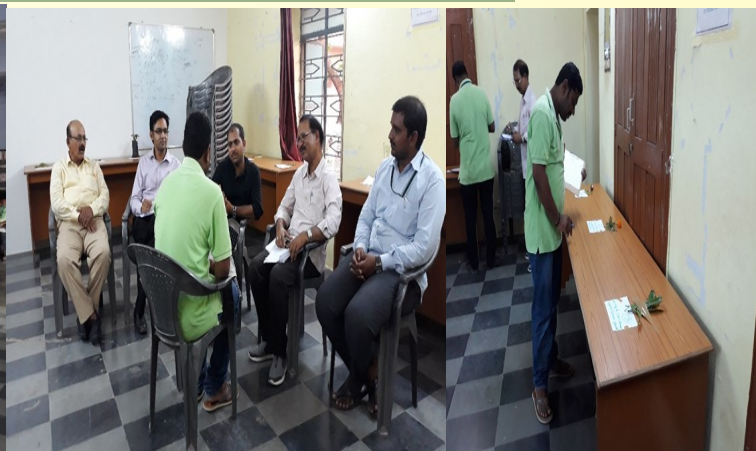
DAESI (2016-2017 batch) Final Exam, Final Viva-Voce & Spotting (identification of specimen) at KVK, Jammikunta, Telangana on 25.03.2018