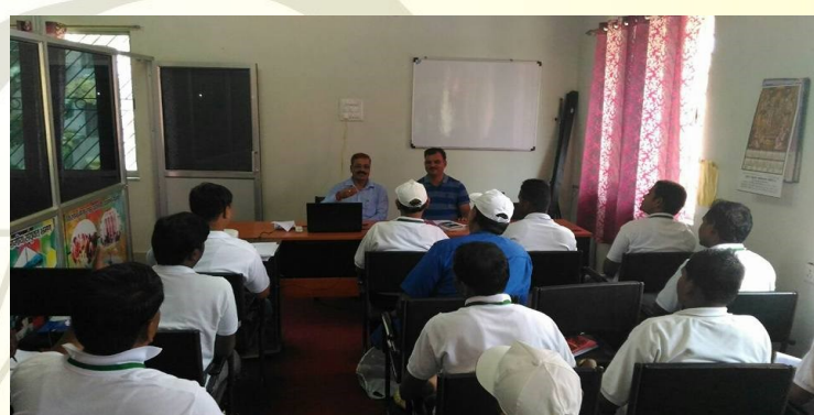
reviewed the implementation of the program. and