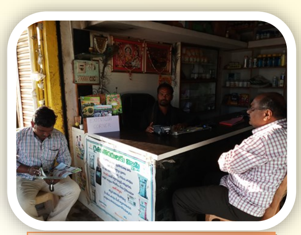
Extension Corner in Adilabad, Telangana

Extension corner: In order to achieve the overall objective of DAESI program i.e., transform Input dealers into Para-Extension professionals, MANAGE promotes establishment of an "Extension Corner" by the trained input dealers in their Input shop. Extension Corner is a place where the Input Dealers keep publications such as Newsletter, Pamphlet, Leaflet, Folders, Magazines, etc., related to major crops of his area. The technical publications in local languages, Information related to ongoing flagship programs of Central and State Governments will be kept in the extension corner as a source of information to the farmers visiting to his shop. This will facilitate to strengthen the extension system.