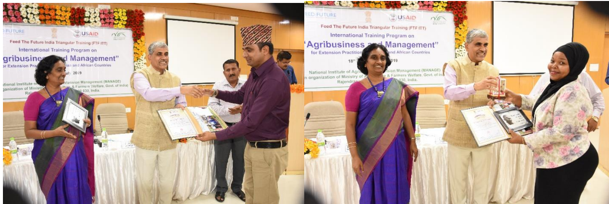
35 th FTF ITT training participants receiving certificate from the Dignitaries