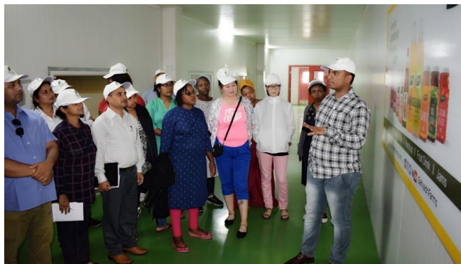
Executives visit to Sahyadri Farmers Producer Company Limited, Nashik, Maharashtra

The training program was participatory in nature, which included lectures, group discussions,