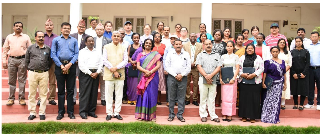
Group Photo of 35 th FTF ITT Program during the Valedictory Function