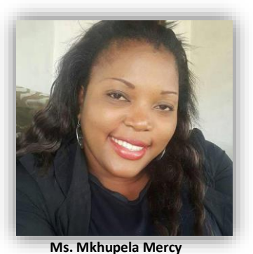
Enterprise Development Officer, Malawi

"Personally I found the workshop to be very informative. The training presenters provided relevant modules with specific hands on skills. The skills and knowledge gained will be valuable in my professional and personal life. It is encouraging to know that almost all the presentations evolves