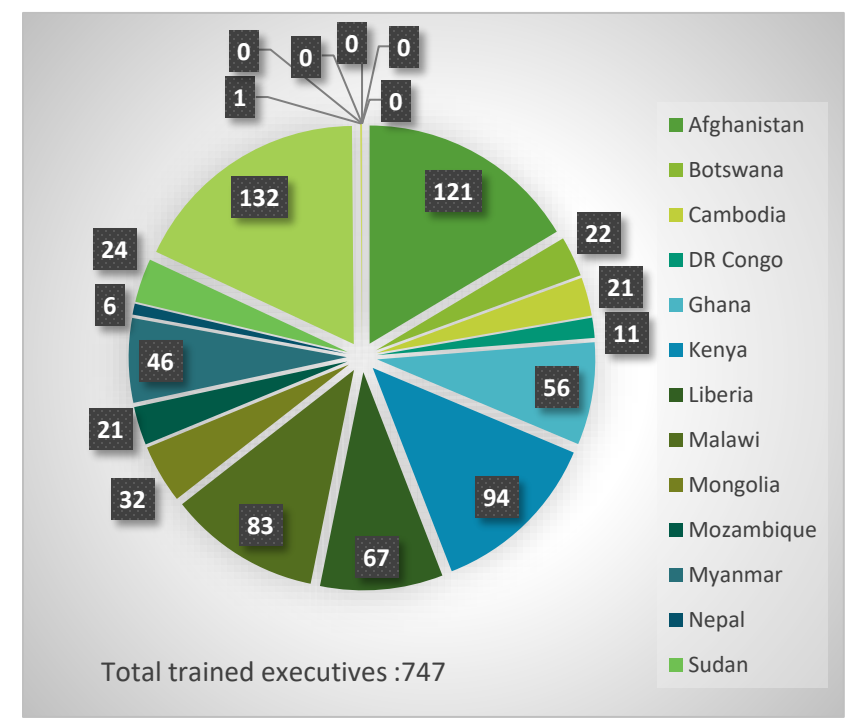
Participation of executives from Partner countries in the FTF ITT