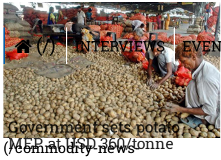
Government sets potato MEP at USD 360/tonne (/commodity-news-national/2016/07/Government-sets-potato-MEP-at-USD-360tonne)