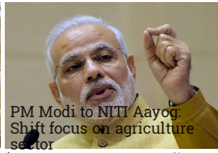
PM Modi to NITI Aayog: Shift focus on agriculture sector (/news/2016/07/PM-Modi-to-