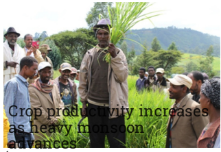
Crop productivity increases as heavy monsoon advances (/news/2016/07/Crop-