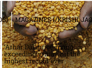
Arhar Dal price rising exceedingly may hit the highest record ever (/commodity-news-national/2016/07/Arhar-Dal-price-rising-exceedingly-may-hit-the-highest)