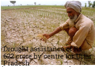
Drought assistance of Rs 622 crore by centre for Uttar Pradesh (/news/2016/07/Drought-