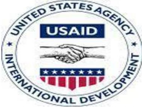
Feed the Future India Triangular programme launched by India and US.

NEW DELHI: The ministry of Agriculture and Farmers Welfare and the U.S. Agency for International Development (USAID) launched the second phase of the Feed the Future India Triangular Training Programme. It will bring specialized agriculture training to 1,500 agricultural professional across Africa and Asia.