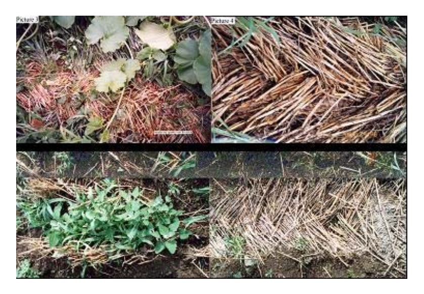
Figure 2. Wheat straws were woven onto the soil surface (Lower left: without woven mulch and weeds thriving; Upper left: pumpkin growing over the mulch).

The author has tried in situ wheat residuals as mulch to suppress weeds in the successive cropping (Xu et al., 2003). The wheat was harvested by cutting the spikes only with the straws left, which were then woven down as pigtail shape on the soil surface. The straws in pigtail shape were closely mulched on the surface and suppressed weeds effectively (Fig.2).