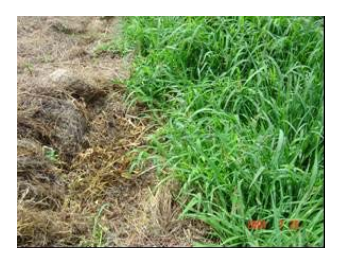
Figure 3. A thin layer of mulch with clipped grasses suppressed the weeds effectively.

Another experiment was done on a small wasteland where weeds were thriving and a thin layer of mulch with clipped grasses suppressed the weeds effectively as shown in Fig. 3. Many research has confirmed the effect of mulching with residual in weed control (Liebl et al., 1992). Although mulching is a useful technique, the thickness required to suppress weed germination varies with the density of the mulch material. Mulch should be thick enough to prevent light penetration and transmission to suppress photosynthesis of weeds. Applying a sufficient thickness for effective weed suppression is often an expensive option. Soil surface can be mulched after the weeds have germinated and the weeds die and ferment under the mulched organic materials as shown in Fig. 3. Mulch layers insulate the soil from high summer temperatures allowing roots to grow to the surface of the soil. Other advantages of the mulch layer include improved soil moisture retention, soil structure and soil fertility.