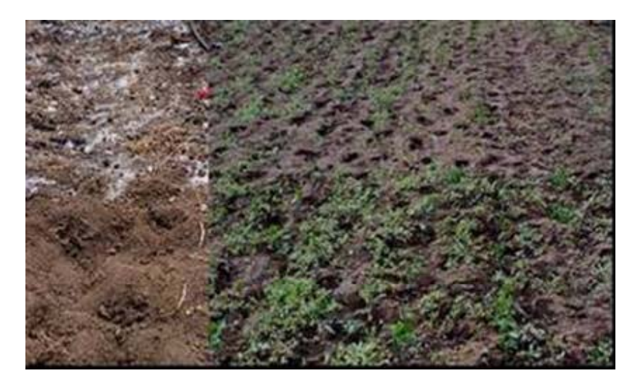
Figure 4. Soil surface application of EM bokashi biofertilizer depressed weeds (Left: before sowing).

First sowing, 1 June 2000; Second sowing, 5 July 2000.