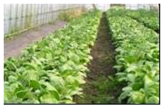
Figure 5. Organic materials placed along the walls of greenhouse (Left) where growing is a brassica leafy vegetable.