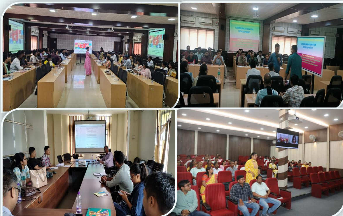
Contact classes conducted at Study centres/ SAMETIs

PGDAEM (Post Graduate Diploma in Agricultural Extension Management) distance program in Offline mode: