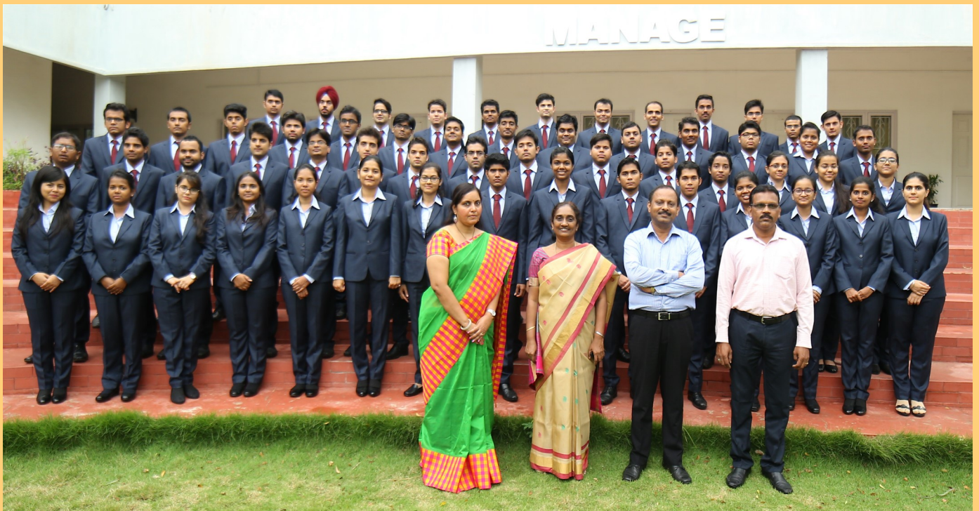
PGDM (ABM) , Batch 2016-18

Hard Work, Perseverance and Team Work are the core values that they learn here and add a new chapter to the legacy of MANAGE.