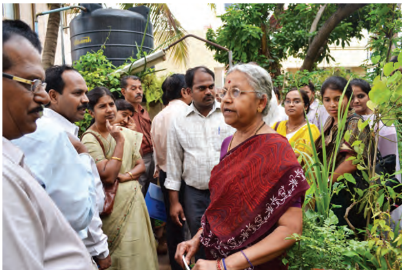
Participants visiting a roof-top garden in Bangalore

Considering the importance, issues, potential and dimensions in Urban Agriculture, MANAGE is organizing four workshops this year, to deliberate on the concept and need for promoting urban agriculture in the Indian context; share and document experiences; examine the planning,