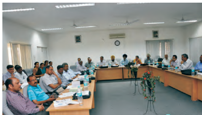
Participants at the Workshop

A two-day Training Planning Workshop of MANAGE, Extension Education Institutes (EEl)s and State Agricultural Management and Extension Training Institutes (SAMETIs) was organised on May 18 and 19, 2011 at MANAGE. The basic objectives of the workshop were to elicit suggestions for establishing better linkages and synergies among the three levels of extension training institutions viz., MANAGE at the national level, EEl)s at the regional level and SAMETIs at the state level; avoid duplication of programmes for the same level of participants by the training institutions; organise need-based programmes for different levels of participants and to make research and consultancy as an integral part of the work plan of all the three tiers of extension training institutions. Some of the recommendations which emerged related to the participants to be trained at each level, building competency of trainers, making training demand-driven, up-scaling Kisan Call Centre Scheme, DAESI, ACABC and