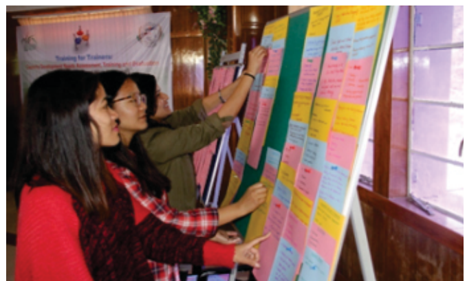
Participants analyzing capacity development needs

The first phase of the training programme on “Training for Trainers: Capacity Development Needs Assessment, Training and Evaluation” was organized by MANAGE, Hyderabad and College of Veterinary Sciences and Animal Husbandry (CVSc & AH), CAU, Selesih, Aizawl, Mizoram during February 21-25, 2017 at Aizawl, Mizoram. The objective of the programme was to assess the capacity development needs of the participants. The areas identified for capacity development, were policy advocacy, community mobilization and managerial ability for senior level officials; community mobilization and managerial ability