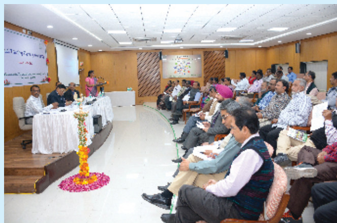
Delegates at the Workshop

The Annual Training Planning Workshop for sharing the Annual Training Programs of MANAGE, Extension Education Institutes (EIs) and SAMETIs for the year 2017-18 was organized at MANAGE during January 18-19, 2017. Fifty nine participants including delegates from the four EIs, 15 SAMETIs, State Agricultural Universities (SAUs) Fisheries