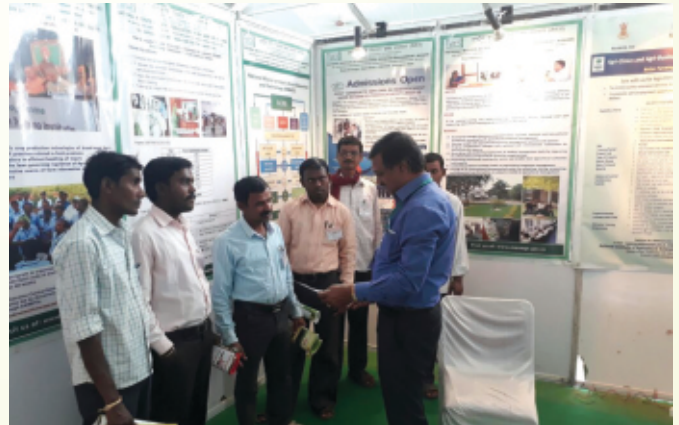
MANAGE at Krishi Samridhhi - Rashtriya Krishi Mela-2017 at Raipur, Chhattisgarh - January 2017