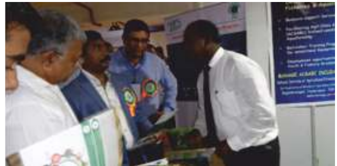
MANAGE participated in the National Fish Farmers Day celebration and Fish Festival at Vishakhapatnam.