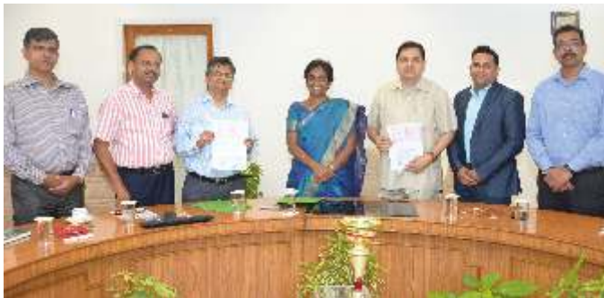
MANAGE MoU with Central Warehousing Corporation

Apart from this, I have got a clear idea on preparing reports / documents. The structure of DPR preparation also helped in personal interaction with the client on how and where to start and the important agenda that should be part of the discussion.