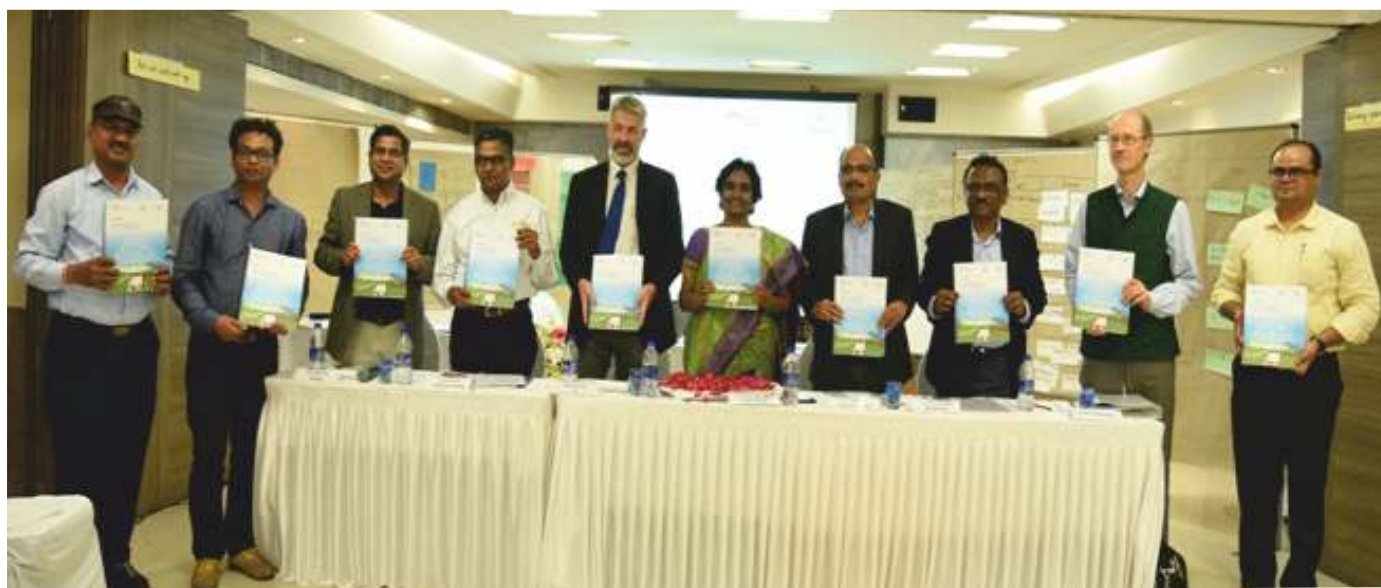
Release of "Training manual for Master Trainers"