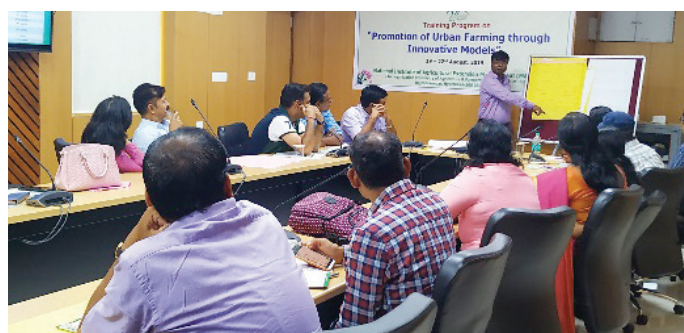
Participants engaged in designing Model Vegetable Garden