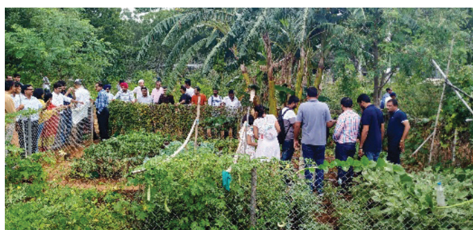
Visit to Urban Garden in MANAGE