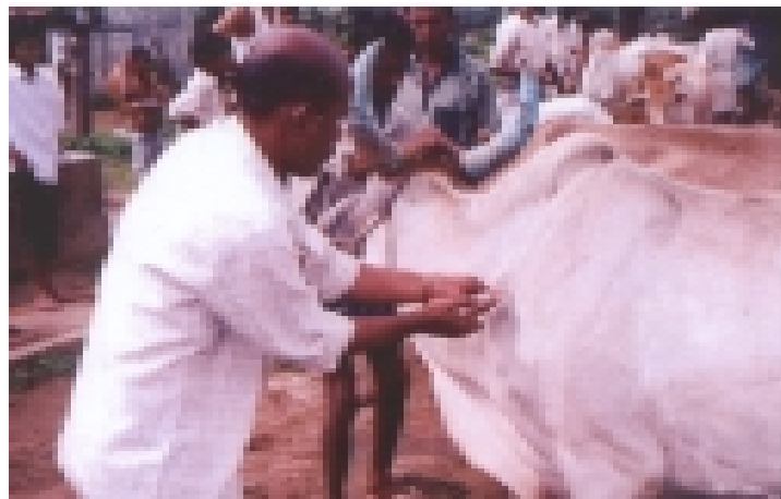
Gentle health care of farm animals

As a part of Farm and Family system approach under Participatory Adaptive research Project, animal husbandry camps were held in Utnoor in eight villages. A total of 1600 cattle were vaccinated, 686 were dewormed and 2111 were given health checkup and consequential treatment as was needed. The adjacent chart gives the quantum of work carried out.