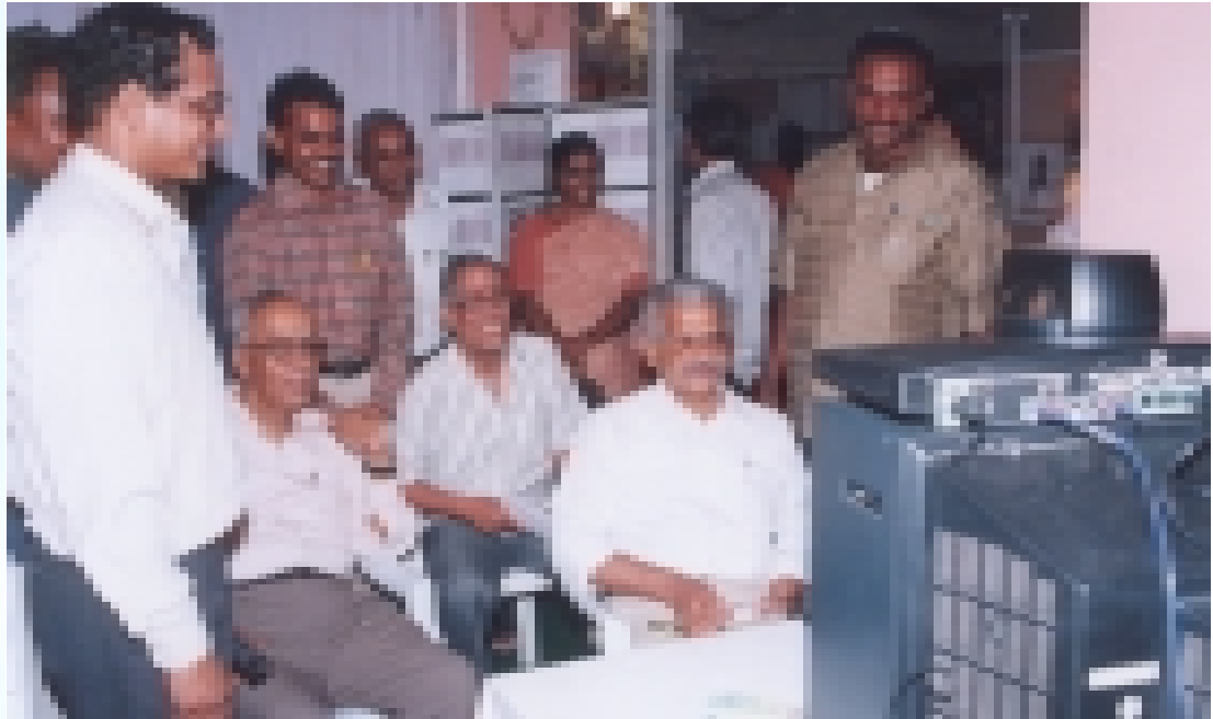
Video Conferencing Demo in TIVOLI gardens

MANAGE participated in a 6-day long cultural meet "Andhra Sangita Saamskritika Mahotsavam" organised by "Sanatana Dharma Charitable Trust and Sivaganga Sangita Parishath" of Bhemunipatnam, A.P., at Tivoli Gardens, Secunderabad during June 4-9, 2001. Over 15,000 people attended the meet from all across the Andhra Pradesh. MANAGE displayed its technical literature on Extension Systems and Models, Vermi-composting, Rain Water Harvesting, Drain Water Harvesting and CDs and Video cassettes on Cyber Extension. The MANAGE stall also had "Video Conferencing" on-line right from 10 a.m. to 7 p.m. daily. The MANAGE