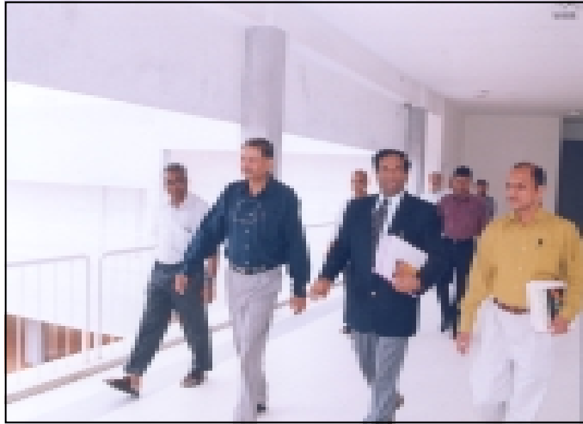
Visitor taking a brisk tour around the campus