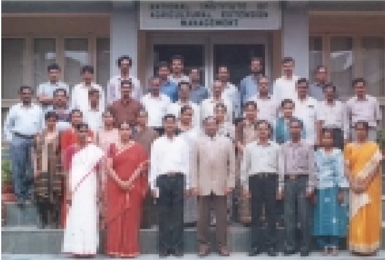
Training Programme on "Positive Attitude, Trust and Inter-Personal Skills for efficient Secretarial Work"