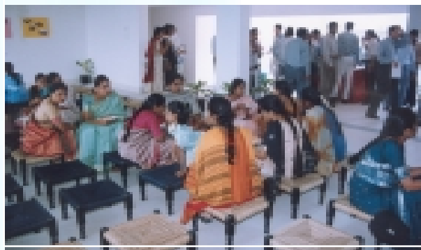
Foundation Day, relaxing after food for thought

One could witness there a group of vibrant, enthusiastic and energetic young learners radiating lot of hope. LET US WISH A HEARTY WELCOME TO EVERYONE OF THE PGPABM STUDENTS.