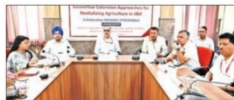
Officers at Capacity Building Programme of FPOs in J&K at SKUAST-J.