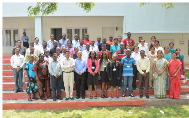
Delegates of the U.S. - India - Africa Training Program with MANAGE Faculty