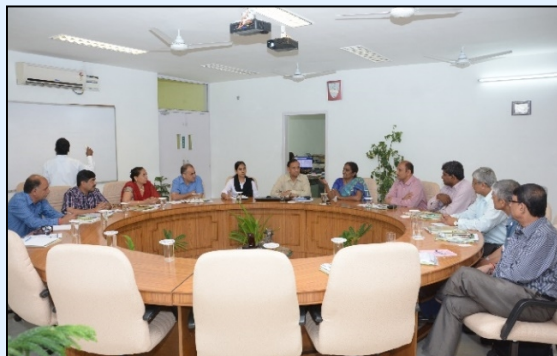
AFU delegates interacting with DG, MANAGE and Faculty

Senior administrators and faculty from Agriculture and Forestry University (AFU), Nepal visited the National Institute of Agricultural Extension Management (MANAGE) on 8 th September, 2015. This visit was a part of Agricultural Innovation Partnership (AIP) project of USAID being implemented by Cornell-Sathguru, Hyderabad to build institutional capacity, develop human resources and improve organizational functioning.