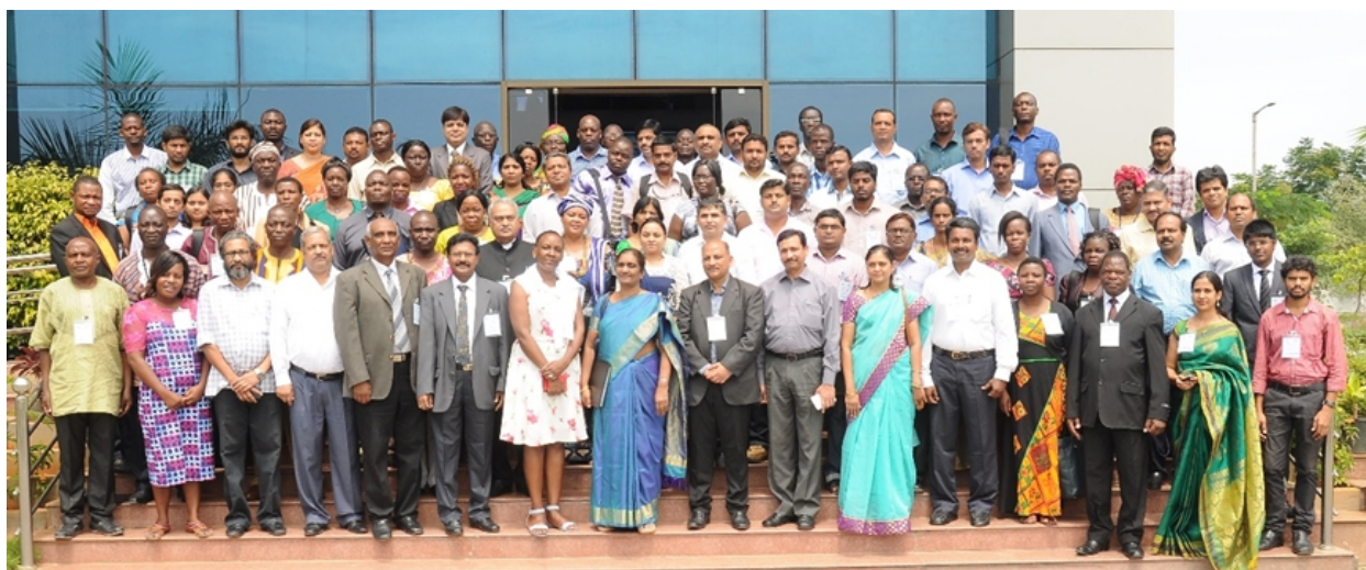
Conference participants, dignitaries and experts

MANAGE organised a two-day International Conference on “Good Governance in Agricultural Extension” during 3-4 September, 2015 in collaboration with Center for Good Governance at CGG Campus, Gachibowli, Hyderabad.