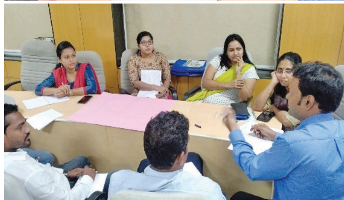
Inducing the new concepts of Agripreneurship and startups among extension professionals thus increasing their competencies

entrepreneurial initiatives in agribusiness in India, technology innovation and commercialization, strengthening the startups through better business modelling, planning, strategizing, marketing and IPR for scaling up. The programme covered 24 participants.