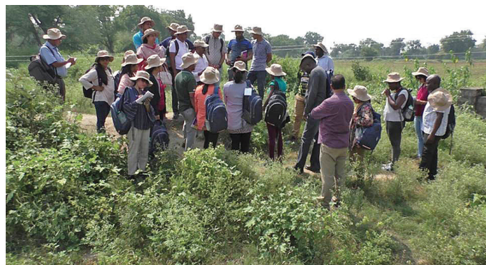
Participants examining the water harvesting system at the project site in Jhansi with CAFRI scientists

This program was conducted in three phases; the first phase was conducted at the World Agroforestry (ICRAF), Delhi which focused on agroforestry policy, research and development and new innovations. The second phase on research and development, practice and on the field learning was held at ICAR-Central Agroforestry Research Institute (CAFRI) Jhansi, Uttar Pradesh. The third and final phase of the training focusing on the impact of agroforestry through industrial linkages and business