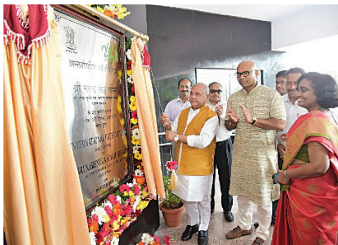
Hon'ble Minister inaugurating the International Guest house at MANAGE