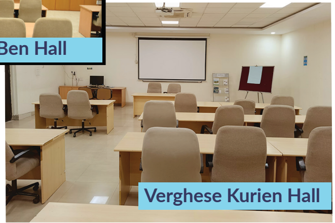
Verghese Kurien Hall