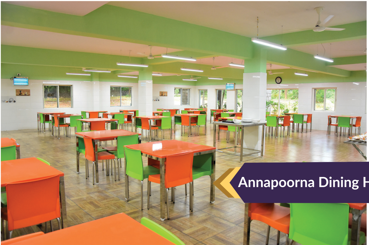
Annapoorna Dining Hall