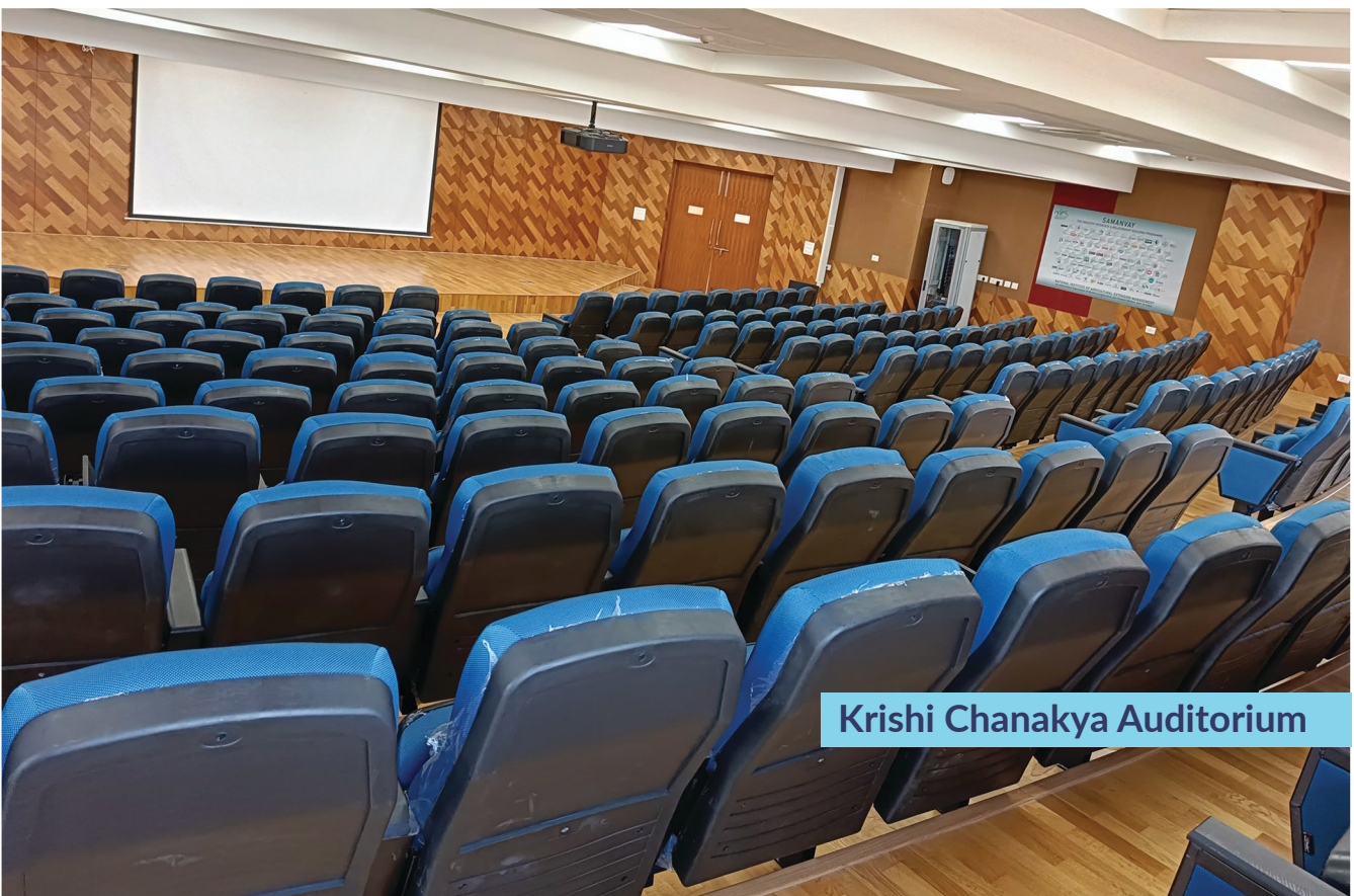
Krishi Chanakya Auditorium