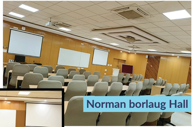
Norman borlaug Hall