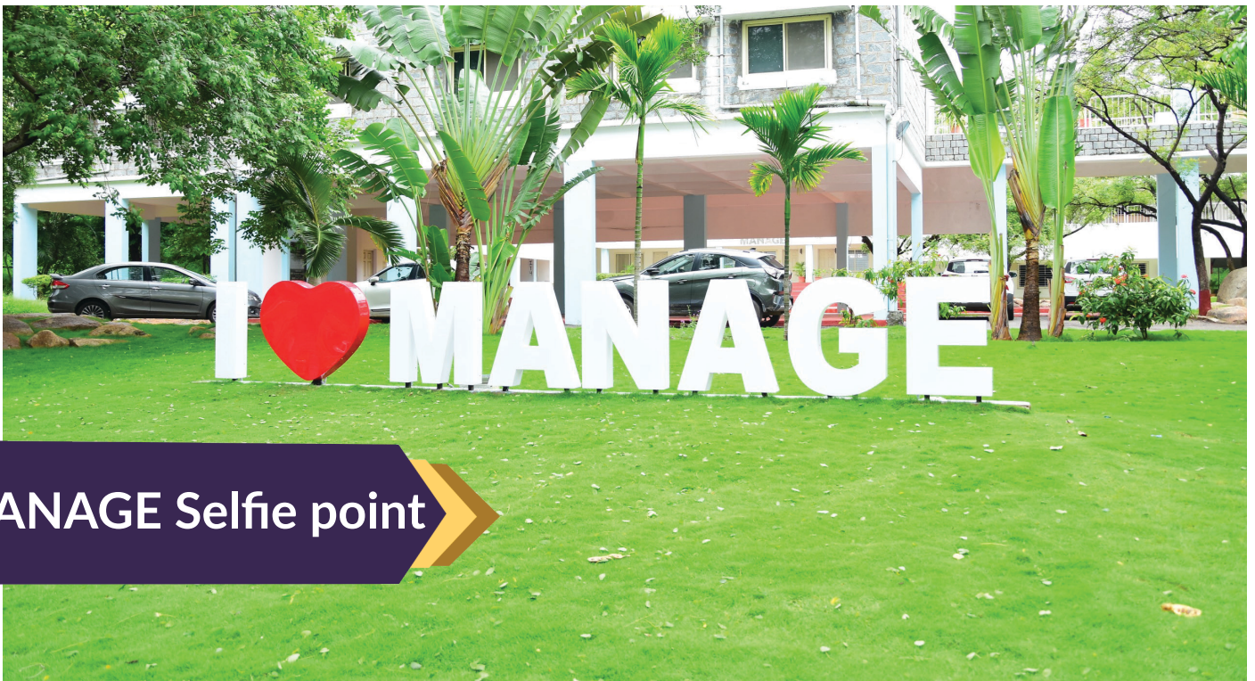
MANAGE Selfie point